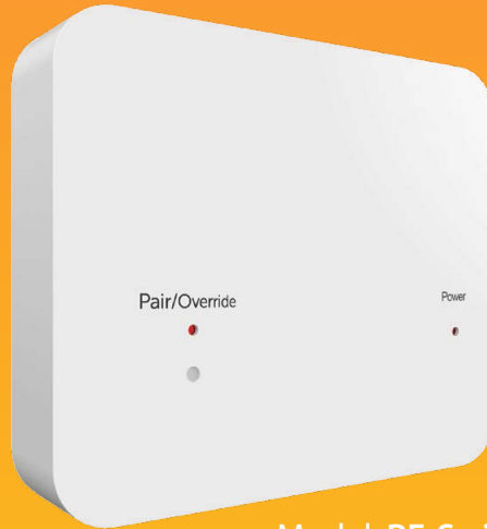
Model: RF-Switch 16A