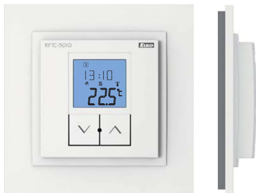
Flat design - the depth of the device is only 20 mm!